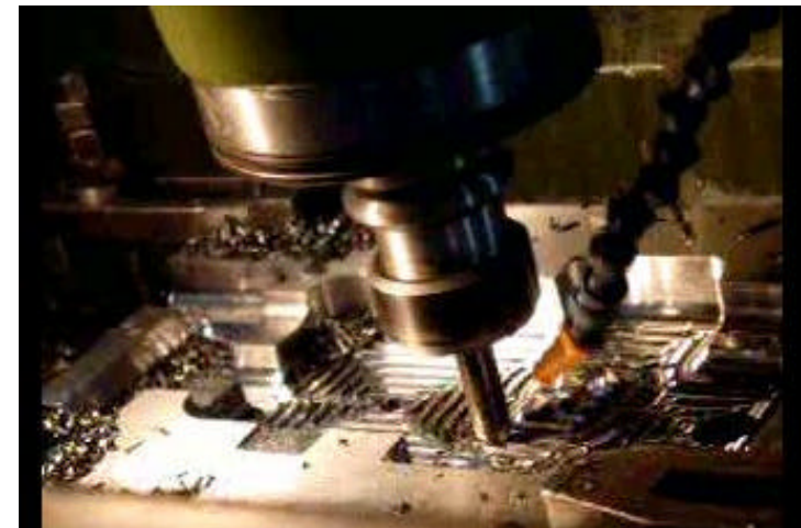
View of machining